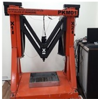
2-Axis Milling Machine (Parallel Kinematic Machine)