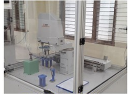
Industrial Robot Cell (Mitsubishi 4-axis, SCARA)