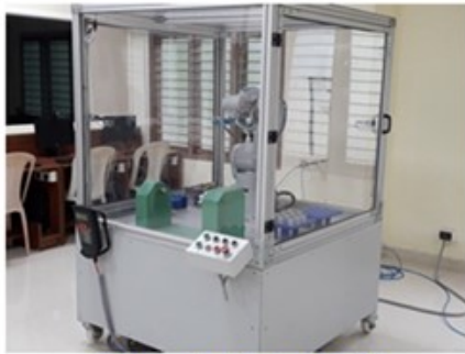
Industrial Robot Cell (Mitsubishi 6-axis Articulated Arm)