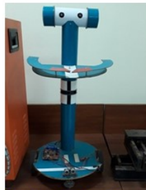
Wheeled Robo Servant