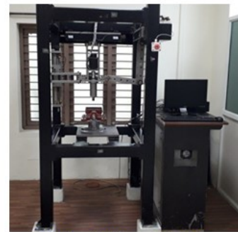
3-Axis Milling Machine (Parallel Kinematic Machine)